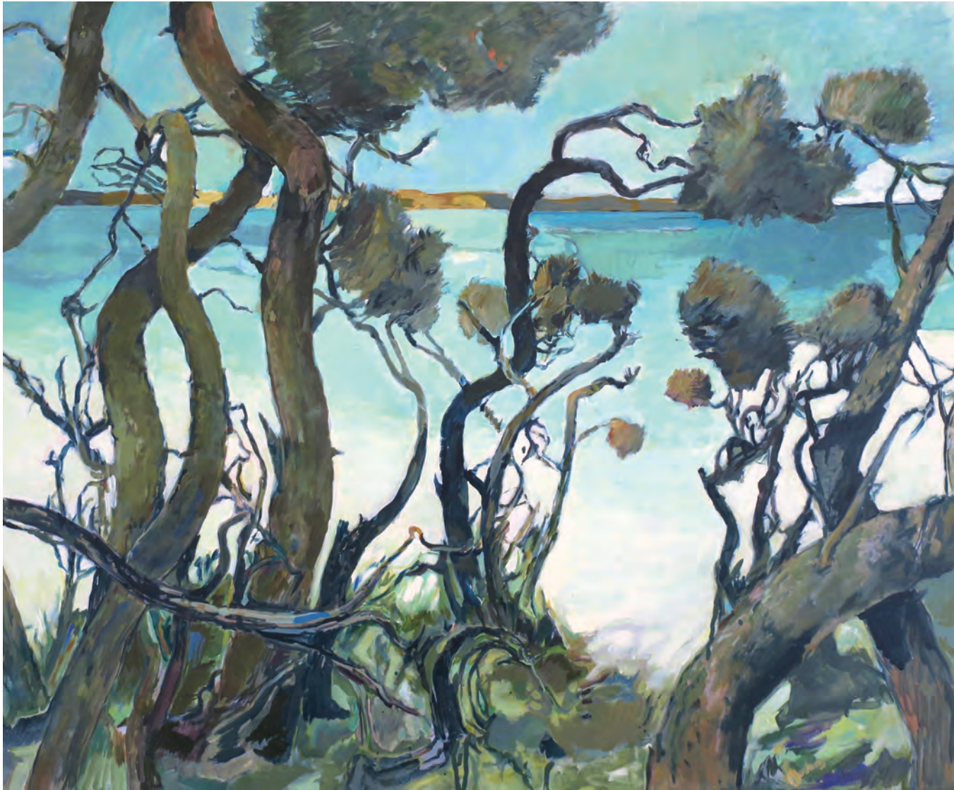
On a Clear Day 76 x 91cm