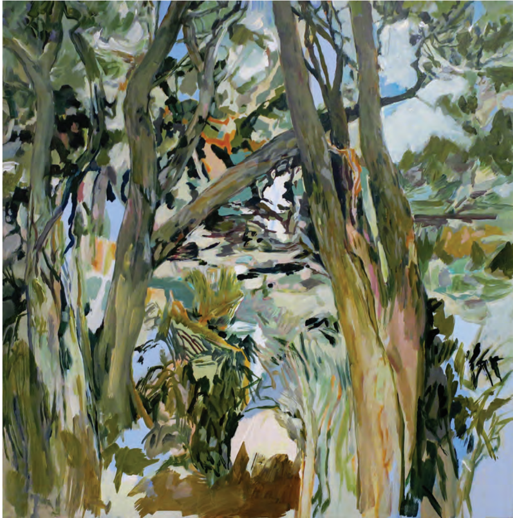
Forest Edge 61 x 61cm