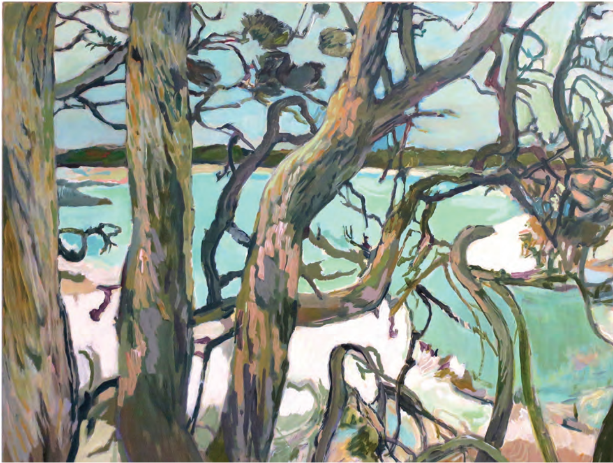
Candlagan Arabesque 45 x 60cm