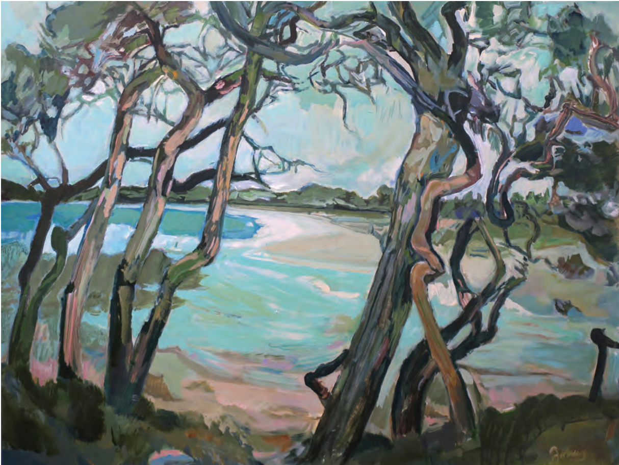
Portal 45 x 60cm