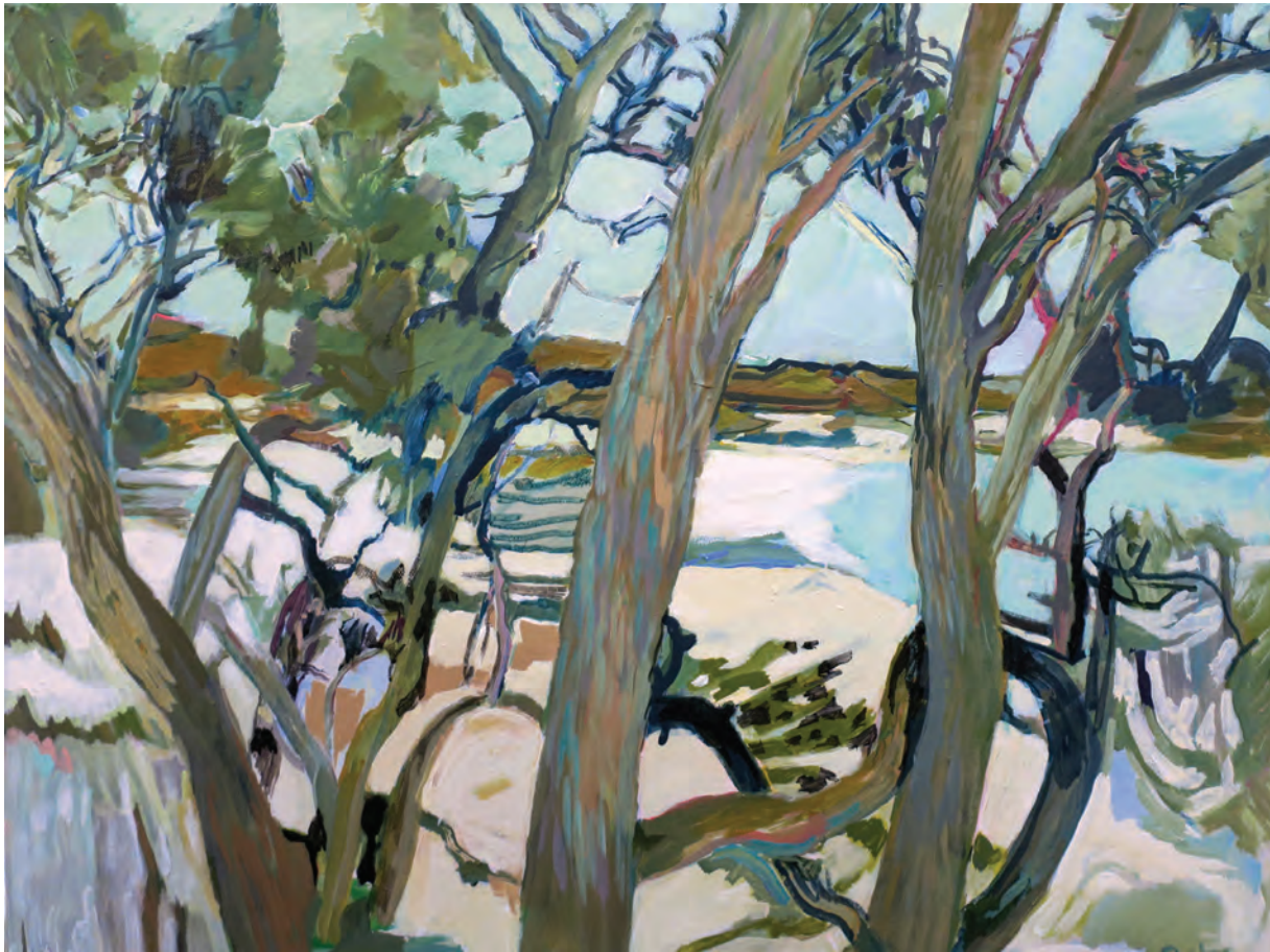
Sandy Bank 45 x 60cm