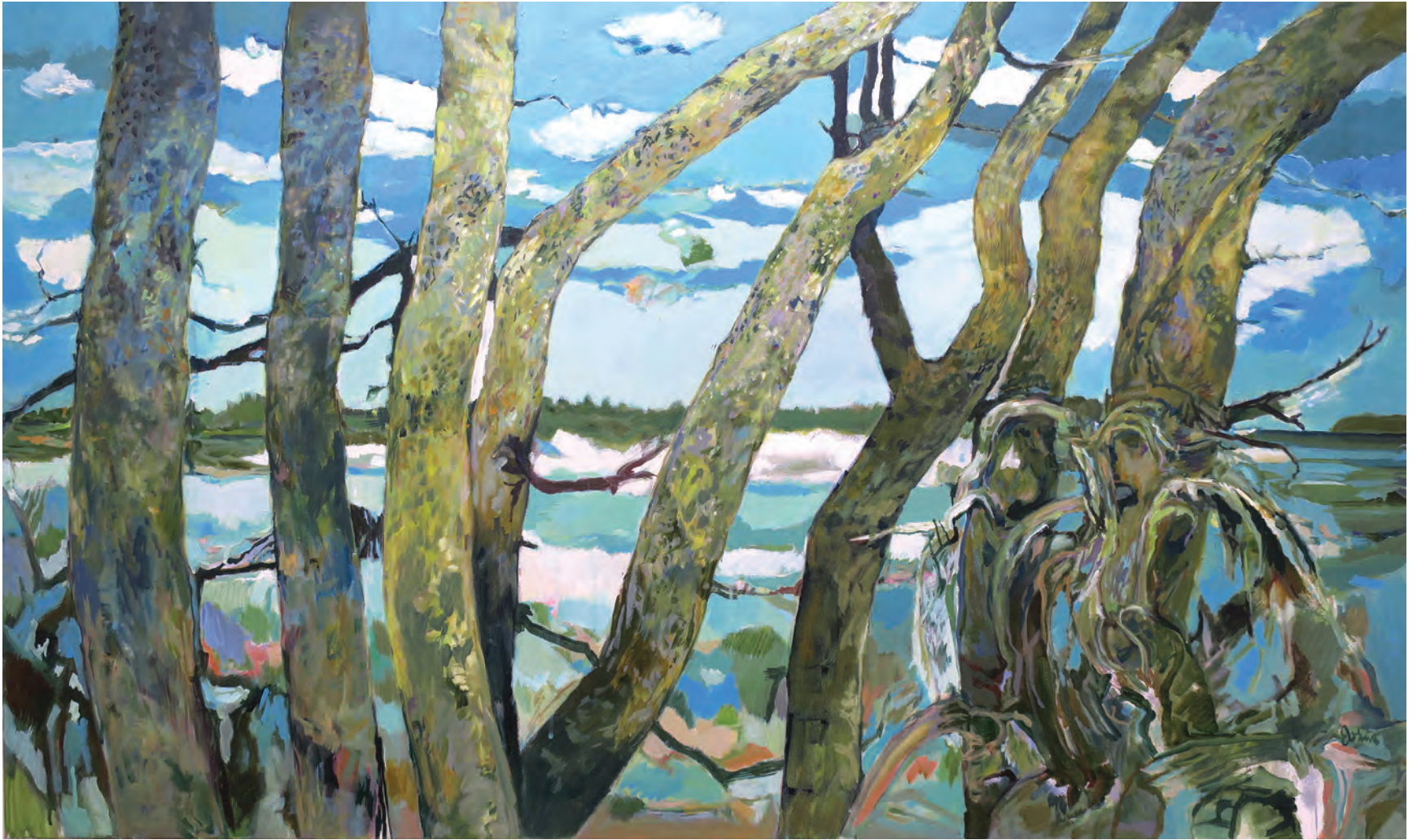
The Far Shore 80 x 133