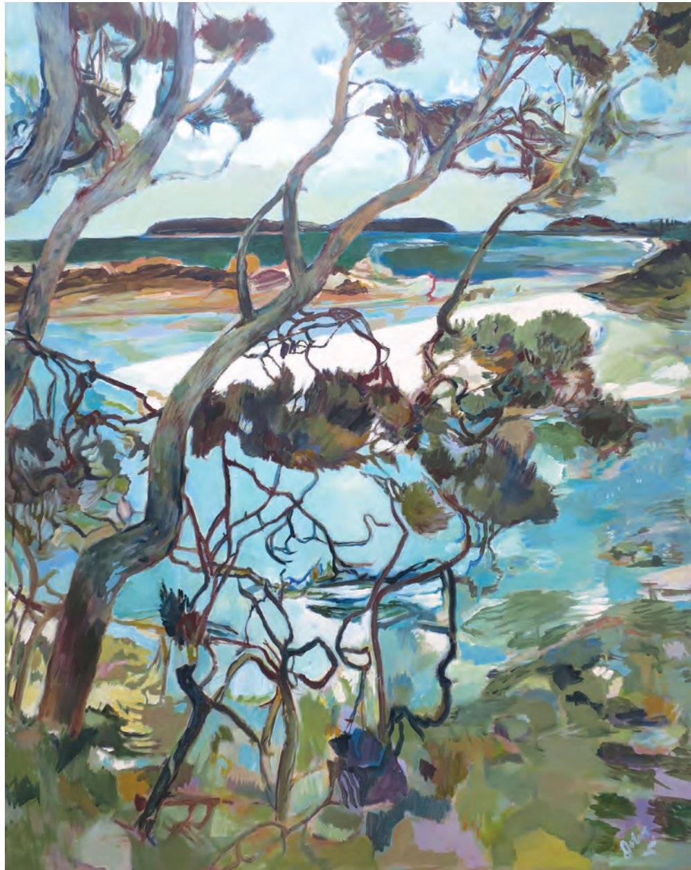
Island and Creek 125 x 100cm $7000