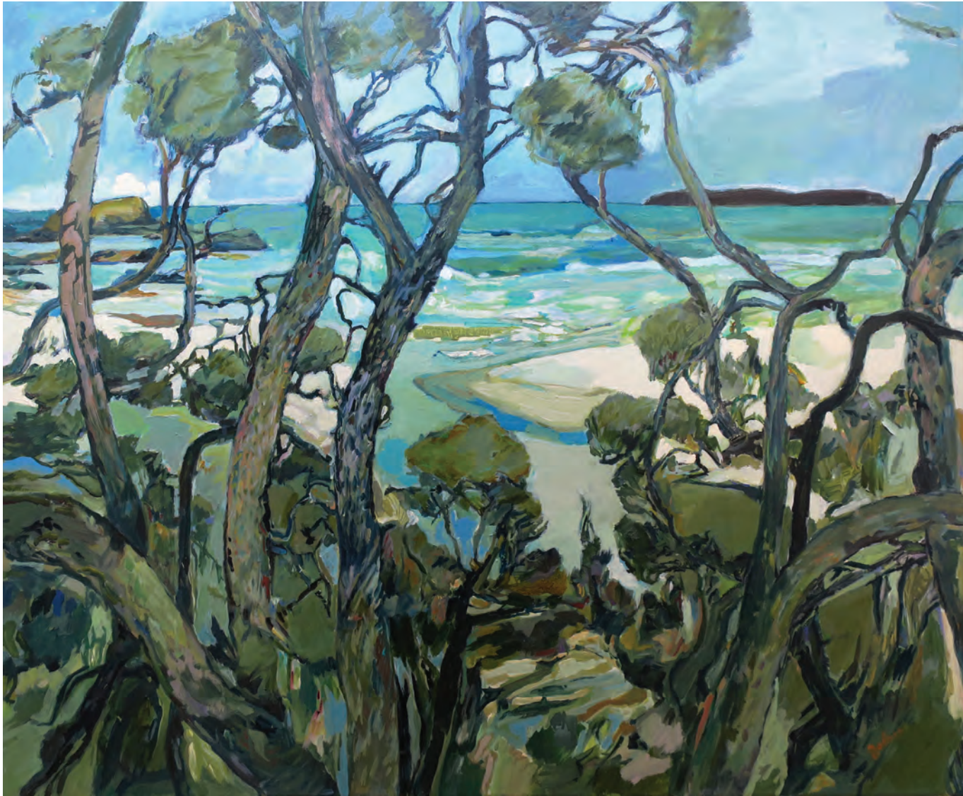
Land of Many Waters 76 x 91cm