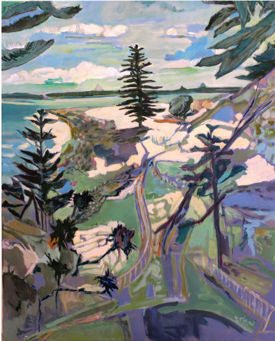
Pines of Lost Memory 76 x 61cm