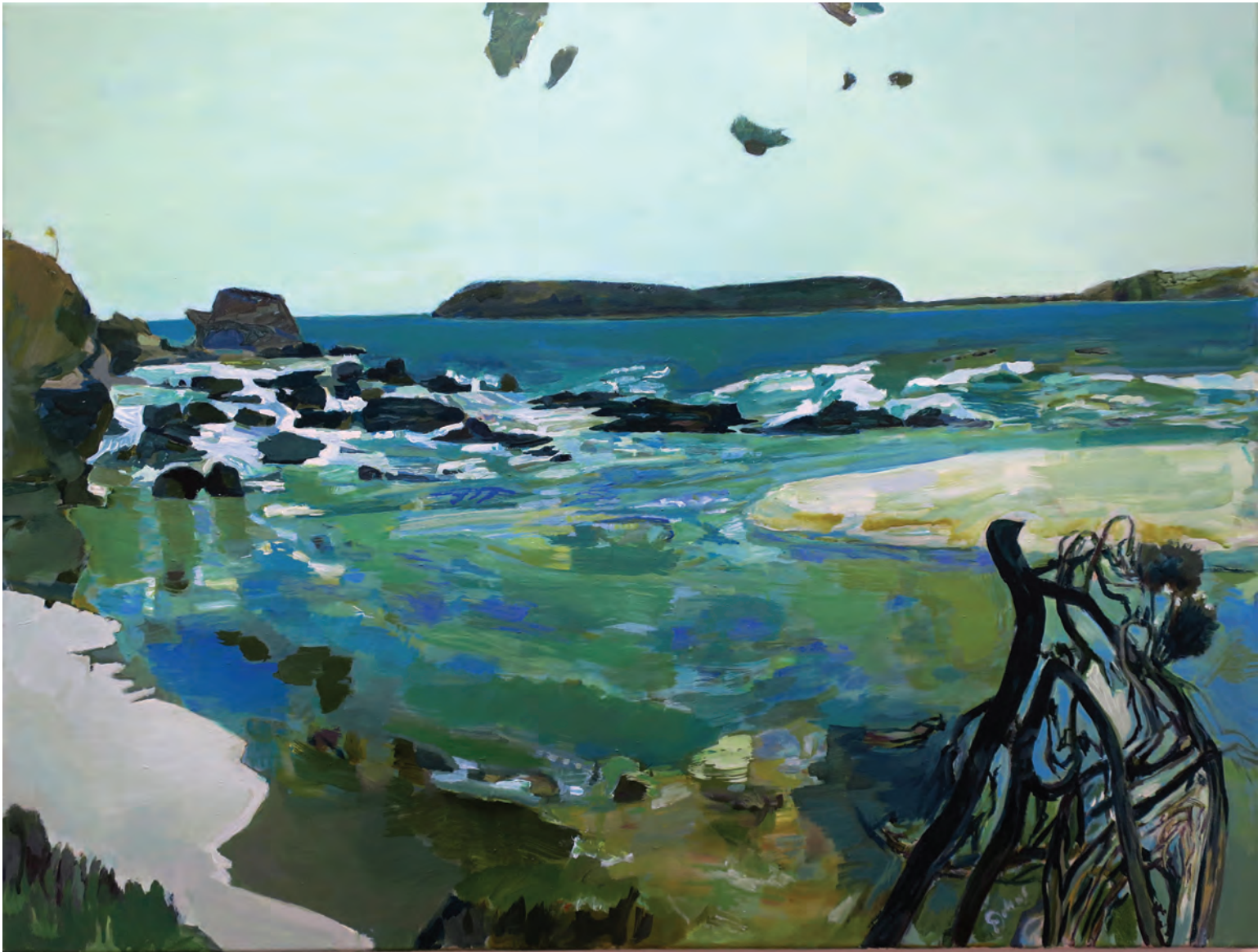
Tide Turning 76 x 101cm