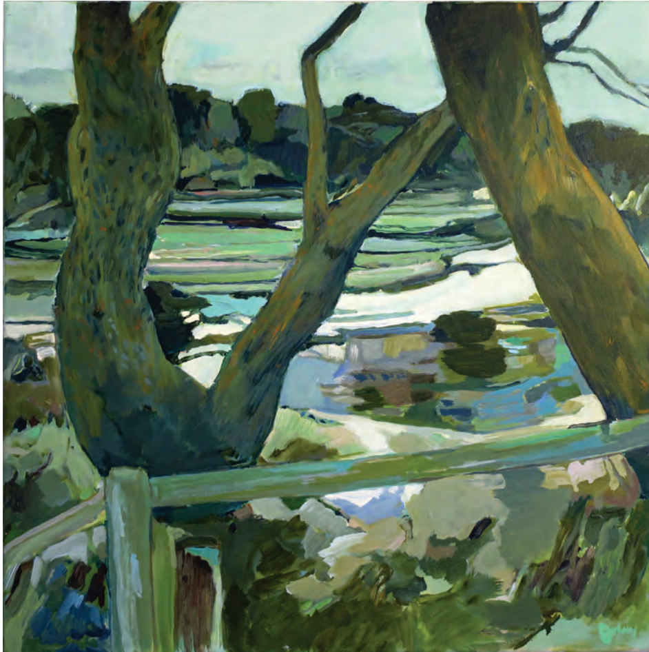
Flooded Lagoon 50 x 50cm