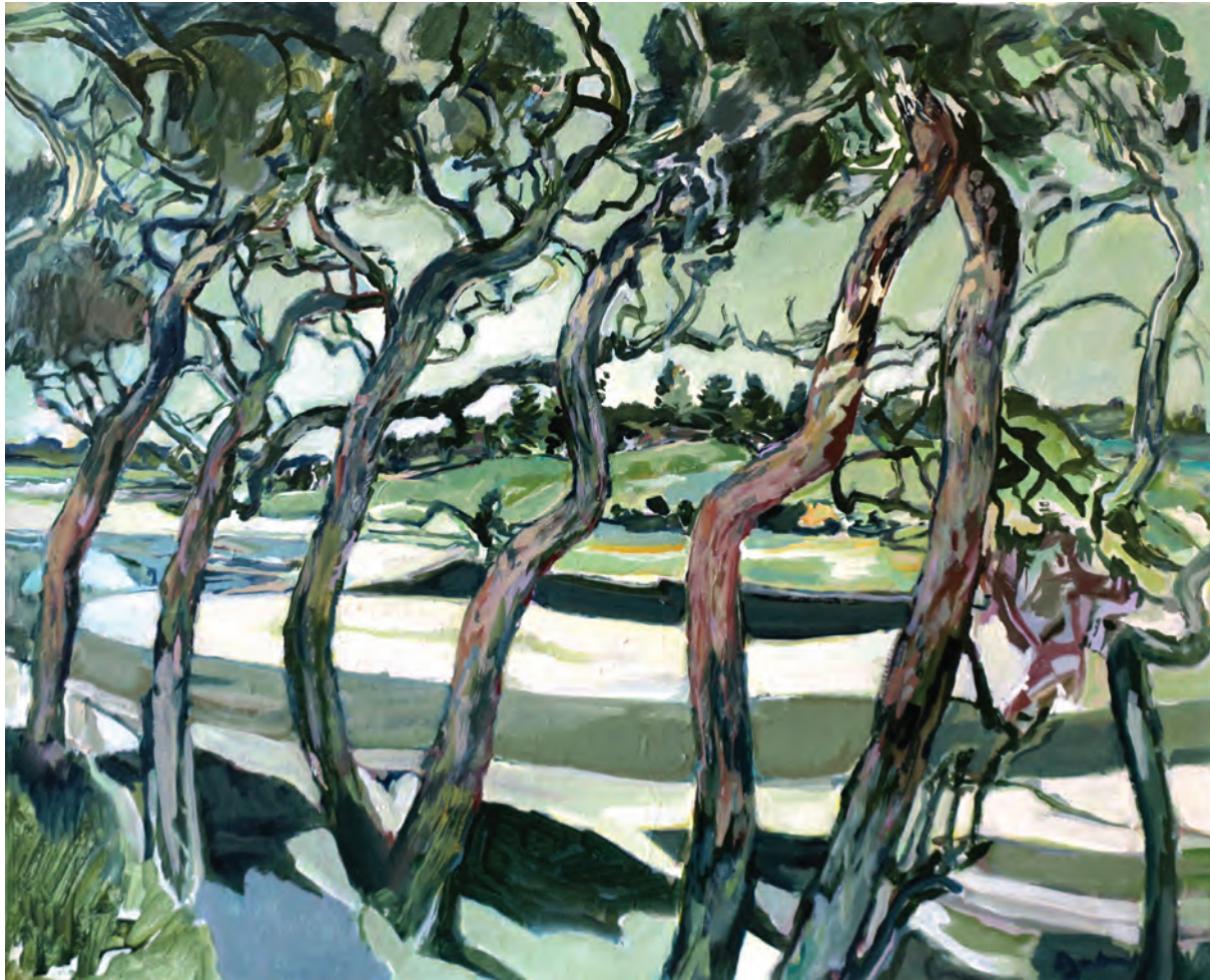
Seaside Town 51 x 60cm