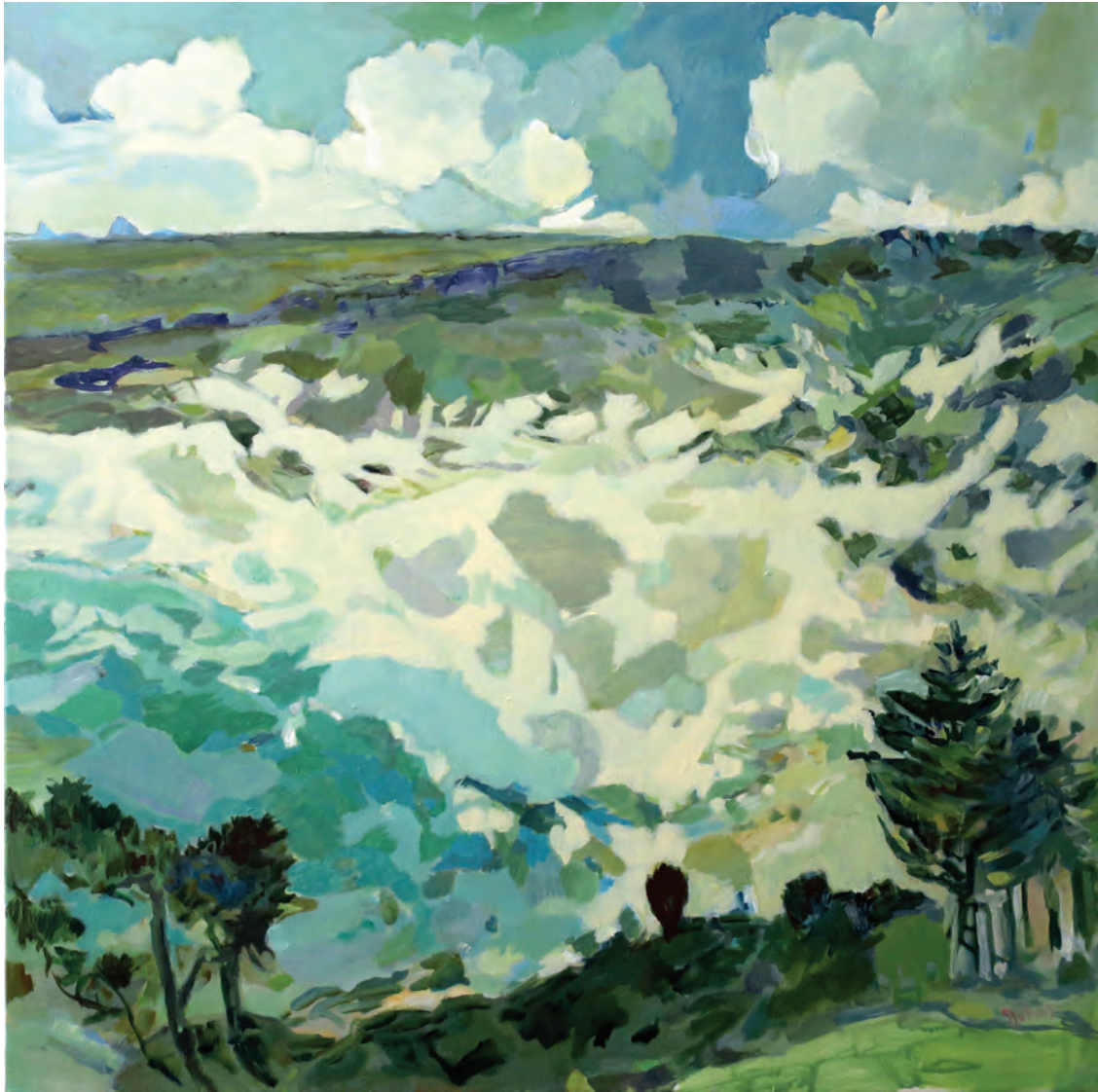
Sandhills Memory 76 x 76cm