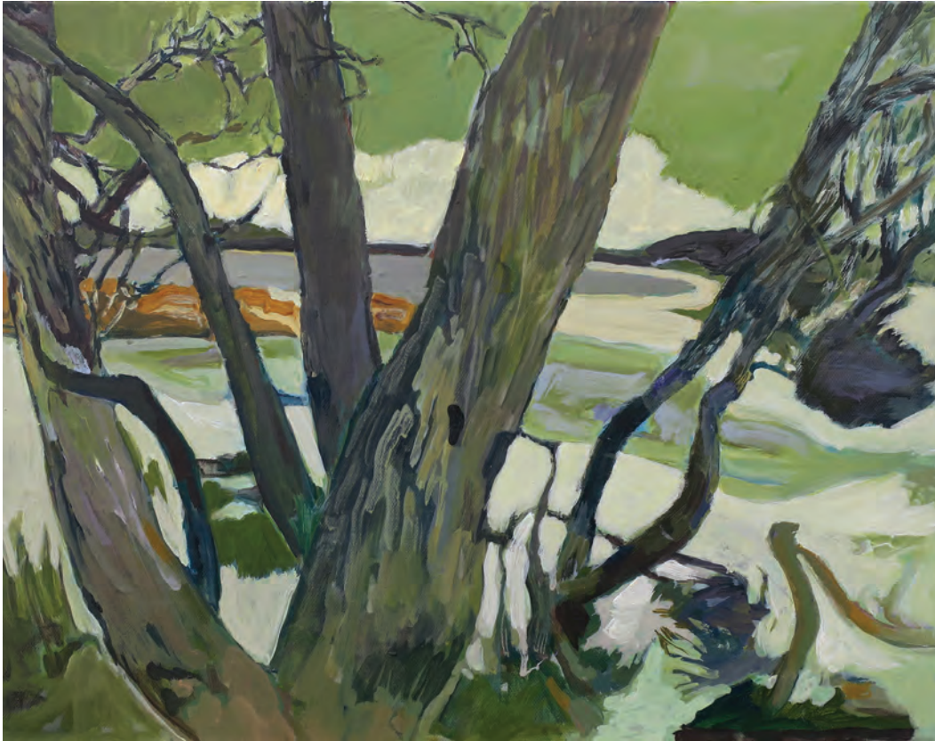
Green Sky Creek 41 x 51 cm