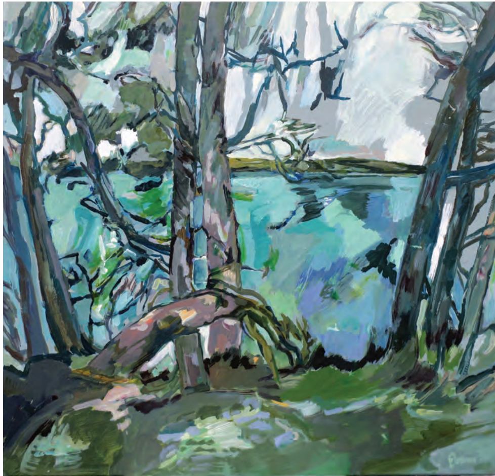
Jervis Bay Marine 50 x 50cm